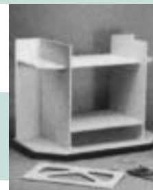
Trupan Veneered application

TRUPAN THIN MDF: Fiber Board with an average of 50lbs/ft 3 (800 kgs/m 3 ) of density.