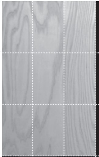
New 95% yield 5' x 8' Panel

That's 95 fewer panels to handle with a 16% improvement in yield.