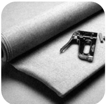
Fabric Wrap Wall Treatments Ideal substrate for custom textured fabric wrap panels. Provides sound deadening, insulation and tackability.

Pricing good through July 29, 2011 as supplies last.