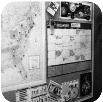
Bulletin Boards 440 becomes the quick, inexpensive, tackable answer, exterior or interior for any home, office, workshop, factory, etc. Can be painted.