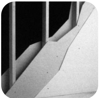
Sound Deadening Deadens sound in residential or commercial buildings. Used in single or multi-family housing, professional buildings. Useful in room partitions.